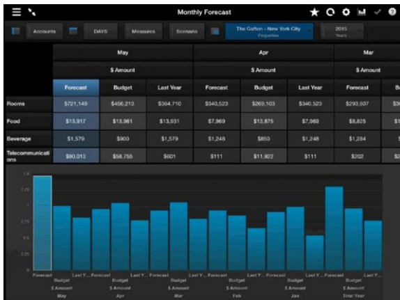
Financial Analysis on Mobile Devices