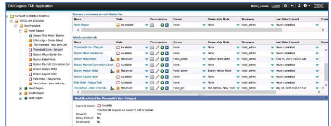
Collaborative Budget Approval Workflow

Our solution provides a faster, streamlined budgeting and forecasting process, reducing manual effort thus enabling accountants and analysts to perform higher value tasks.